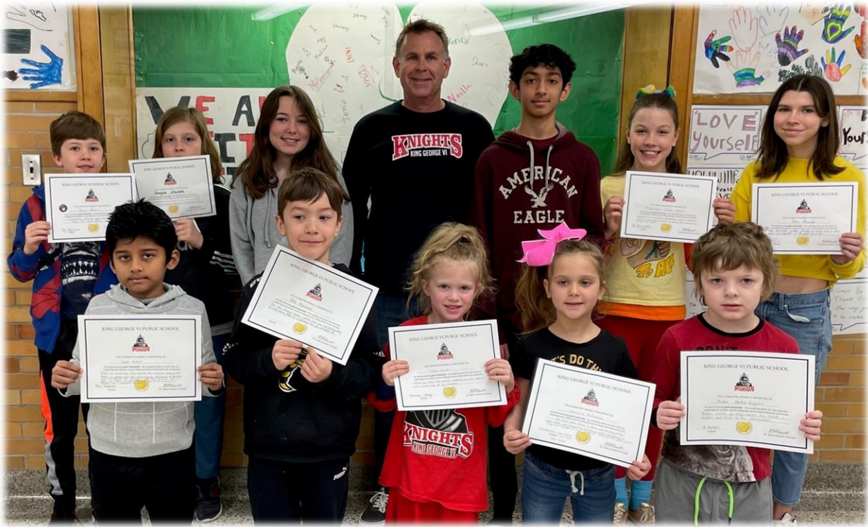
March Knight Award recipients, recognized for hard work & kindness .